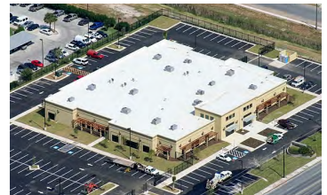
Kika de la Garza Federal Building