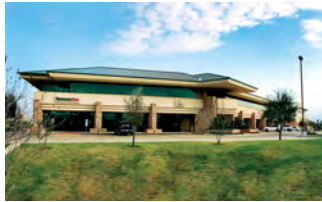
Commerce Center West