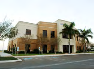
Inter National Bank