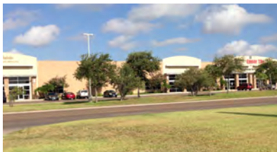
495 Flex Building