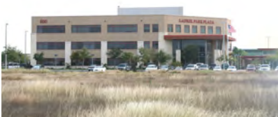
Laurel Park Plaza