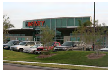
Infinity Call Center